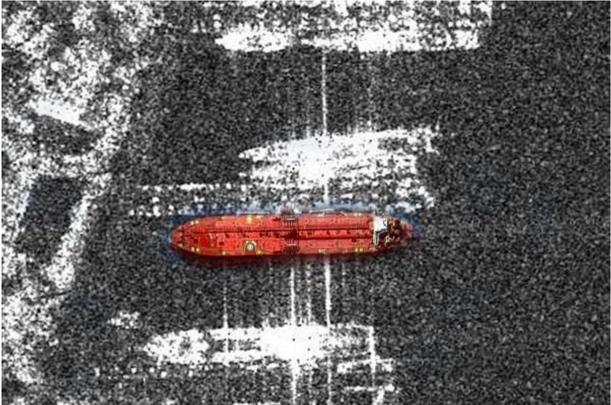
Example of SAR imagery combined with VHR imagery.

This story will give a good impression of maritime projects that have benefited from the use of VHR satellite imagery.