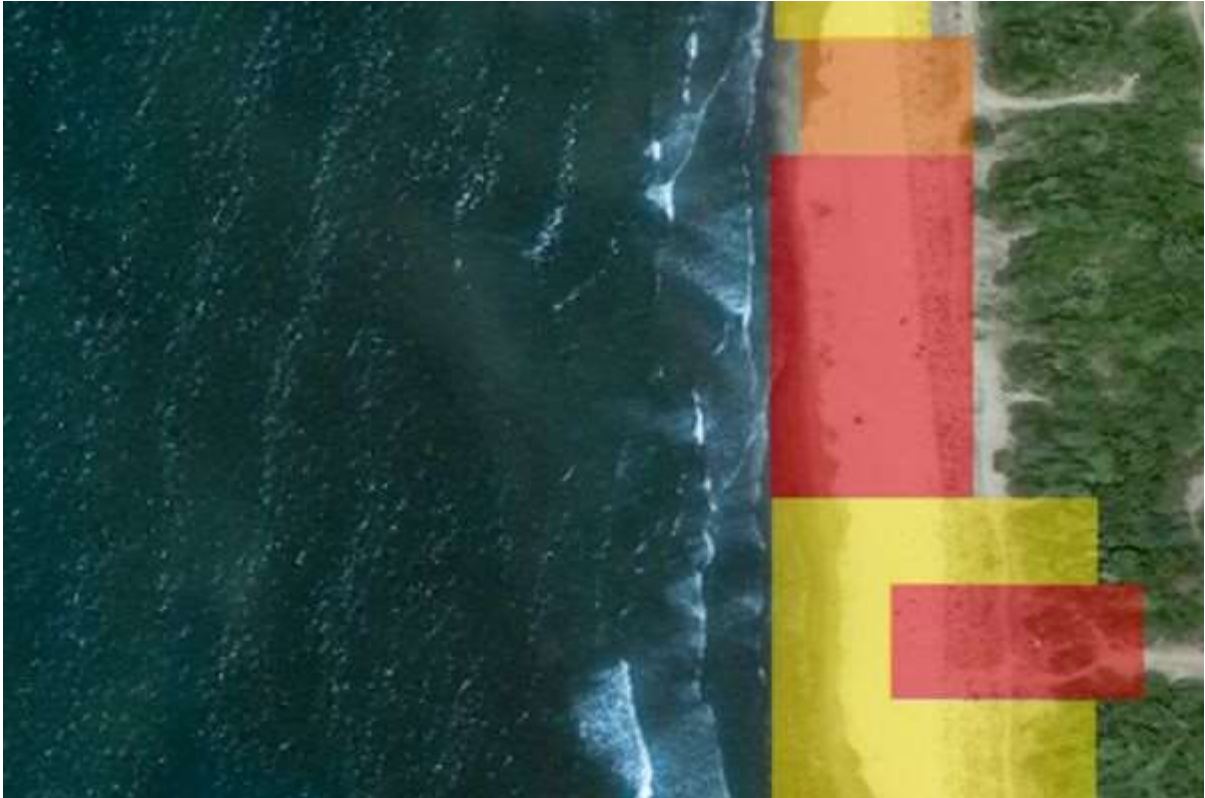
eCognition overlaid VHR imagery to detect litter on Italian Beach.

“The trash we find on beaches is typically a diameter of 10cm and maybe a pixel size long,” Ralph said. “And so we had to take a statistical approach – if there are litter candidates in pixels of that size, at a certain amount of trash it starts looking like a signal. The first part of this exercise was figuring out if it is technically possible to detect this at all.”