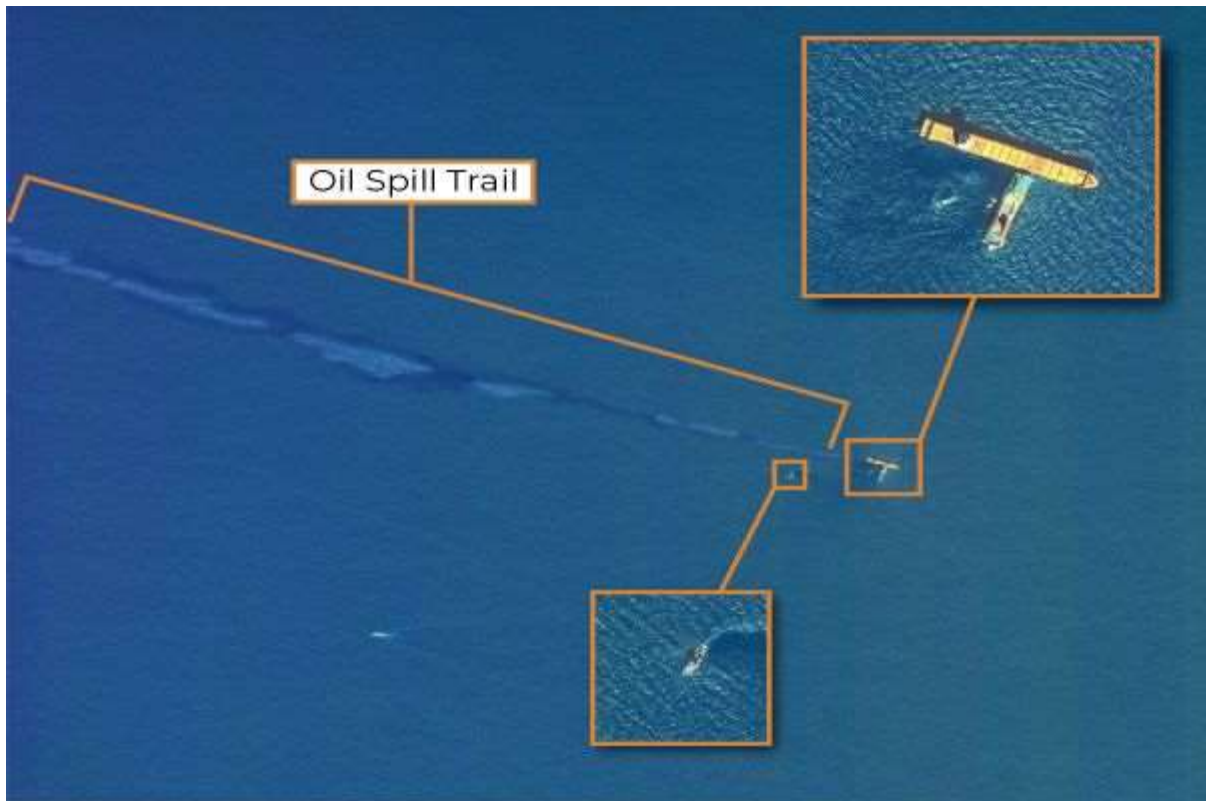
Corsica oil spill overview with close up of the ship and oil spill drift.