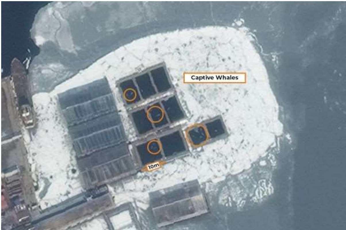
VHR image of whales held in captivity in Russia.